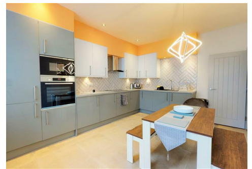
Room 4, 70 The Hollins, Sowerby Bridge, Halifax, West Yorkshire, HX6 2RT £600

***PRE CHRISTMAS MOVE IN INCENTIVES AVAILABLE***FINAL ROOM REMAINING*** - Stunning House Share located in the highly regarded Sowerby Bridge. The property has been finished to an exceptional standard and comprises of 6 en-suite rooms with communal dining kitchen. This room is generously sized with en-suite and is located on the first floor.